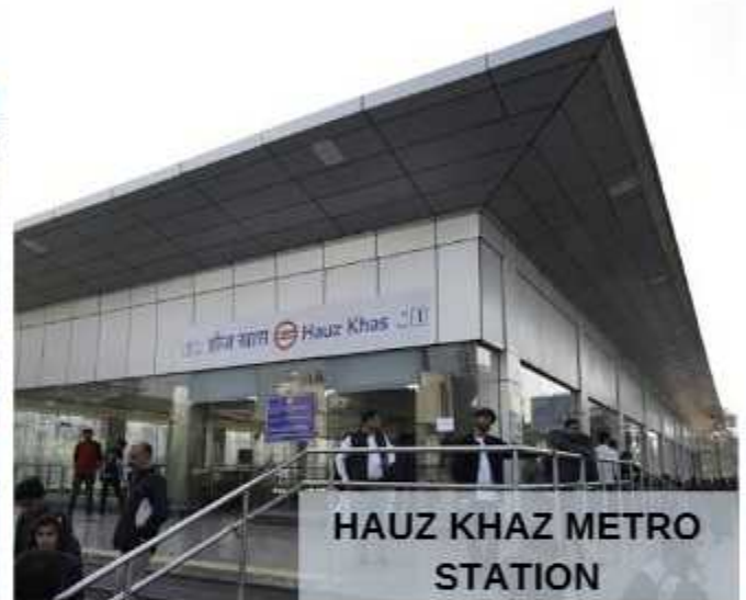
HAUZ KHAS METRO STATION

Projects like Varanasi Airport, Coimbatore Railway Station, Wardha Railway Station and 38 stations of Delhi Metro Rail Corporation are underway.