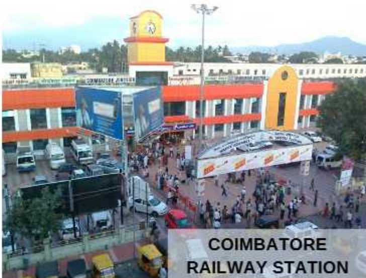
COIMBATORE RAILWAY STATION