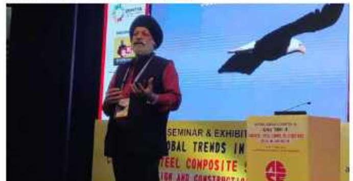
Speaker at the National Seminar & Exhibition on Global Trends in Concrete - Steel Composite Structures Design & Construction .