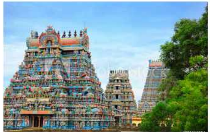
CHENNAI EGMORE RAILWAY STATION