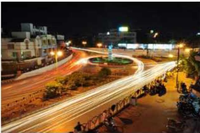
RAJKOT AIRPORT TERMINAL